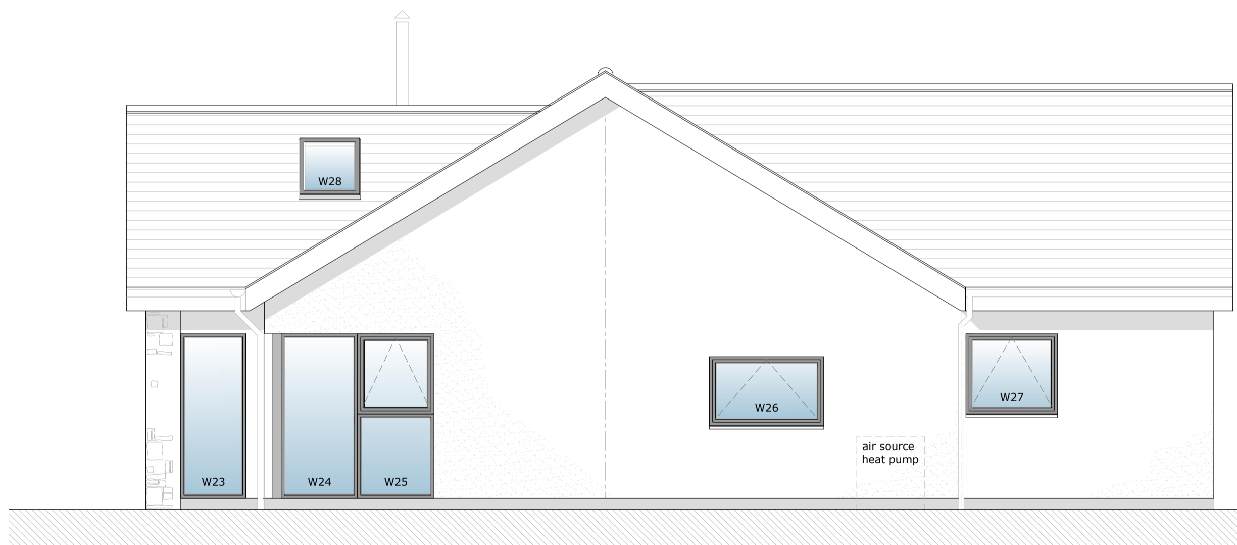
NORTH-EAST FACING ELEVATION (4) SCALE 1:50