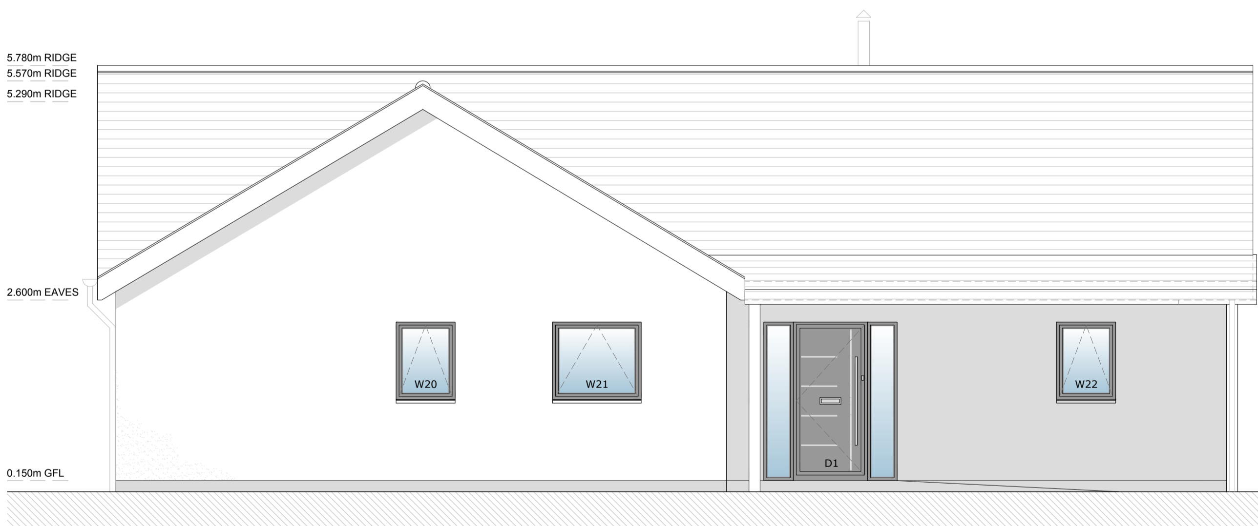
NORTH-WEST FACING ELEVATION (3) SCALE 1:50