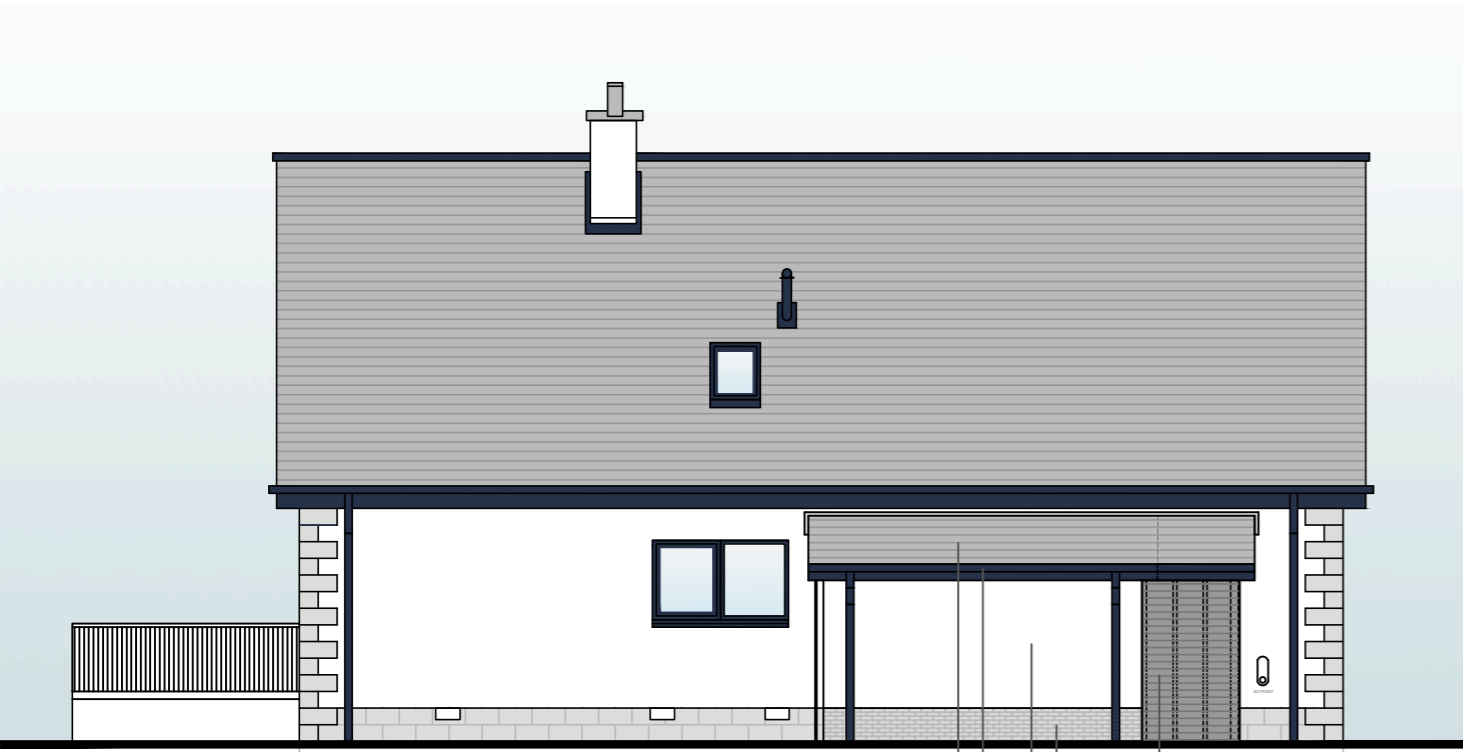
SIDE ELEVATION (EAST FACING) AS PROPOSED

TILED ROOF FINISH AND COLOUR TO MATCH EXISTING NEW GUTTERS AND DOWNPIPES CHARRIED LARCH HORIZONTAL TIMBER CLADDING LIGHT GREY BRICK RENDER FINISH TO MATCH EXISTING